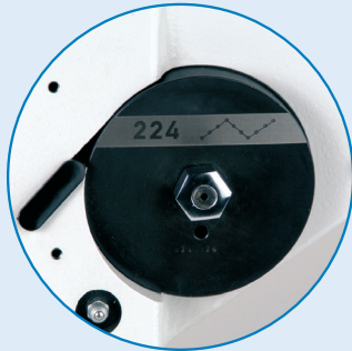
Easily inter-changeable cams